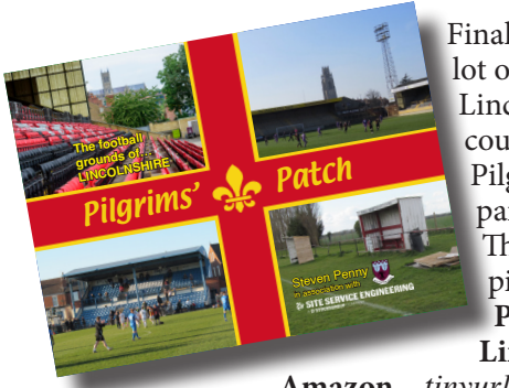
Finally, a bit closer to home, Steve spent a lot of time traversing the highways and byroads of

Lincolnshire to compile the first complete guide to football in the county.