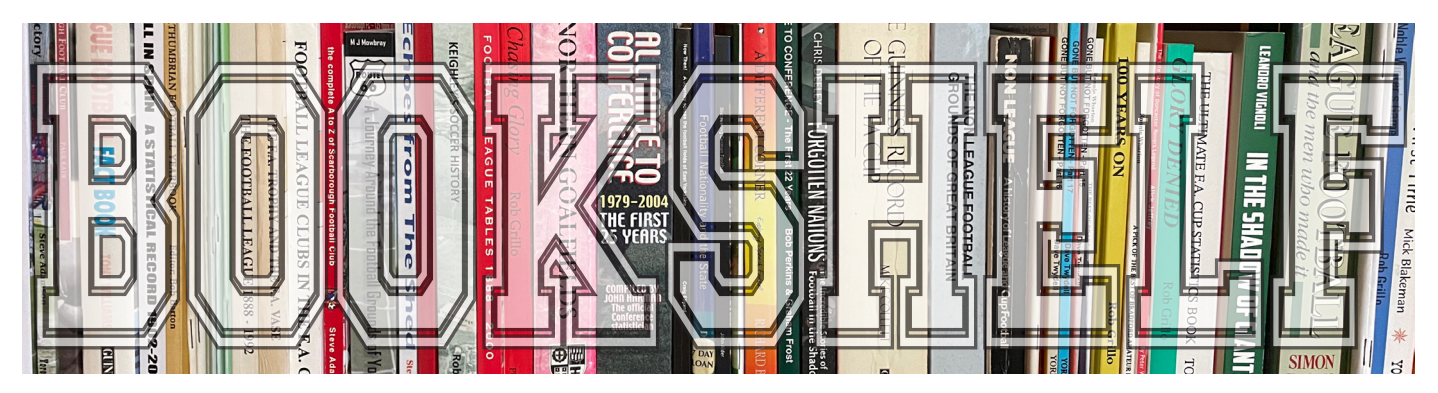
Long-standing non-League football writer Steve Penny has had a busy few months, putting together no fewer than four new books (with another on the way!)

The Tyke Travels yearbook author went back to basics during the tail end of the Covid lockdown to produce a book about grassroots football in Yorkshire, discovering many links to the very pinnacle of the game with visits to 31 grounds across the Broad Acres. Towering Tales & A Ripping Yarn is £11.99 from Amazon – tinyurl.com/ToweringTales (Also available as an ebook at £9.99)